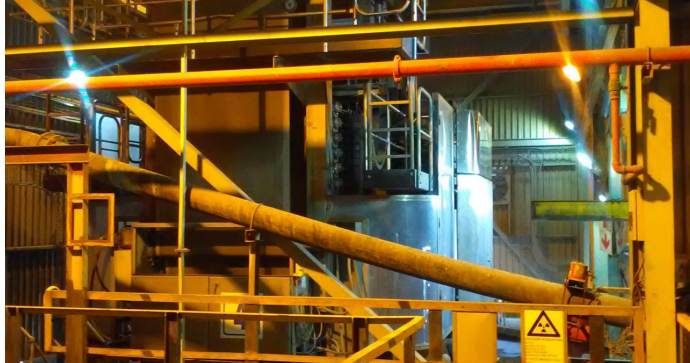
INCREASE IN THROUGHPUT

Mining company Increase in average throughput by more than 5.5%