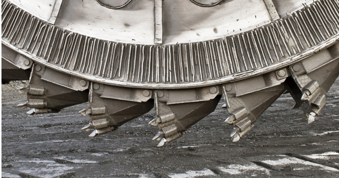
INCREASE IN ENERGY EFFICIENCY

Lonmin 10% increase in smelter throughput