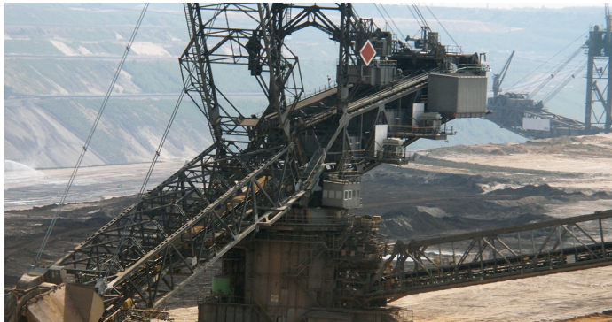
DECREASE IN PROCESS VARIATION

Impala Platinum 40% improvement in pH stability