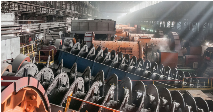
INCREASE IN THROUGHPUT

Impala Platinum 40% improvement in pH stability